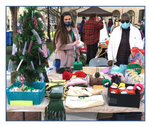
Friends of the Library booth at the City's Holiday Marketplace, November 2020

The book store at the library has been open since the summer and we have launched an online book sale last fall, at the same great prices as always. Visit our page on Facebook (facebook.com/