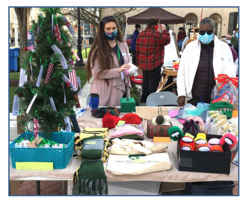
Friends of the Library booth at the City's Holiday Marketplace, November 2020

We hope that you and your loved ones are doing well during these difficult times. We have been working on finding new ways to support the library as the pandemic and safety restrictions continue. The Friends will be sharing many of the newest reading challenges to keep you busy during the cold winter months. We will also be sharing some great titles that will fit the prompts that are available from our online sale or to borrow from the library. Please feel free to reach out to us and let us know how your challenge is stacking up!